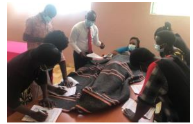
Maternal sepsis training in Kenya