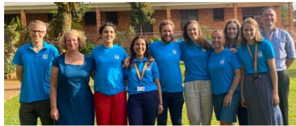
CGHP members visit Uganda in June 2022