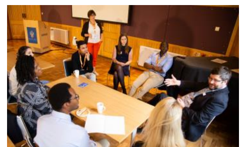
Global Health Fellows sharing and learning event