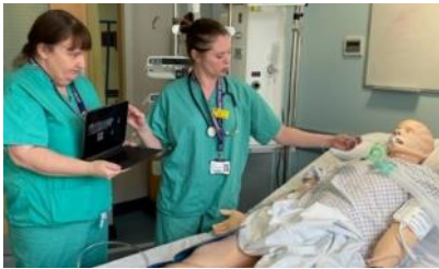
Delivering online simulation training

We are delighted to share our retrospective of the past year, which offers a glimpse of how your involvement in CGHP has made a difference. We hope you will enjoy reading about all our activities and we look forward to continuing our journey with you next year.